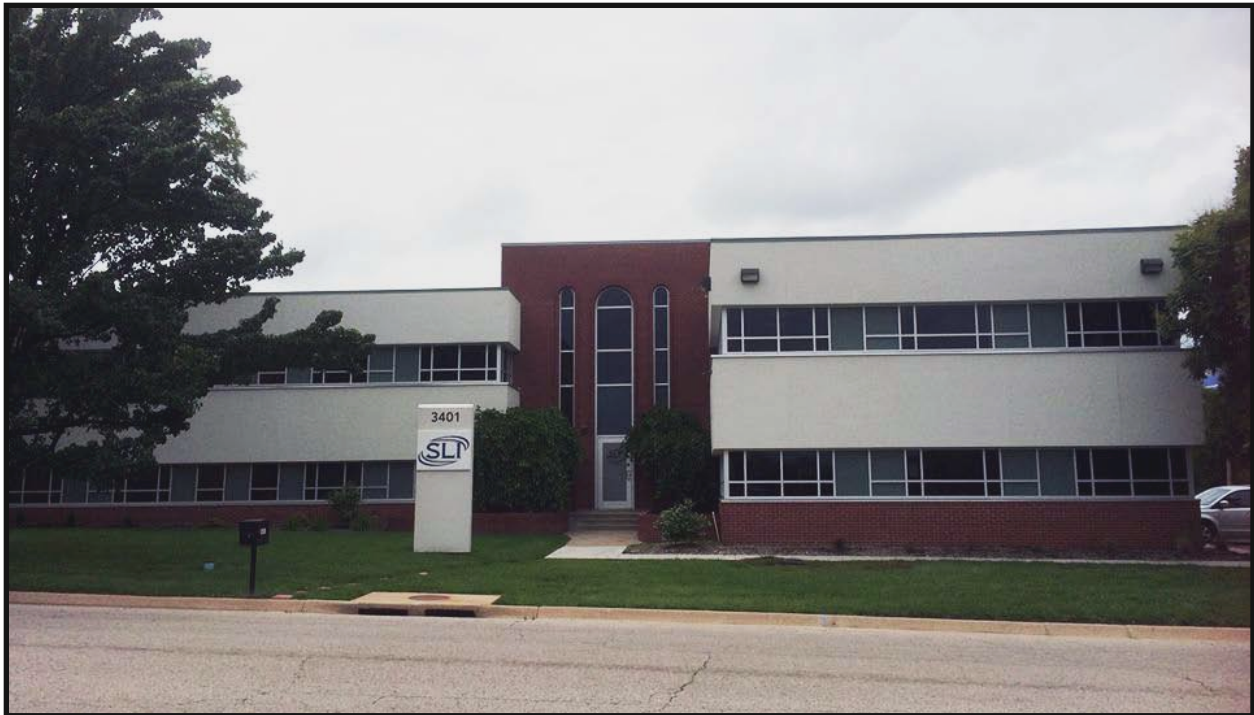
SLI Administrative Offices and Day Service Center