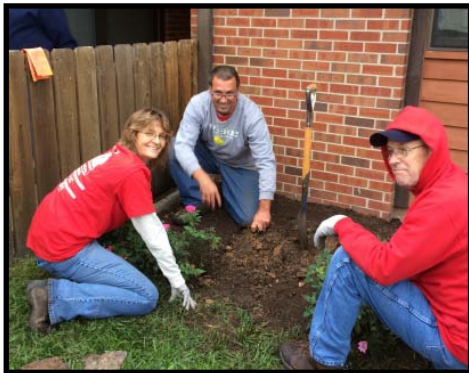
Kansas Department of Administration landscaping a SLI home.